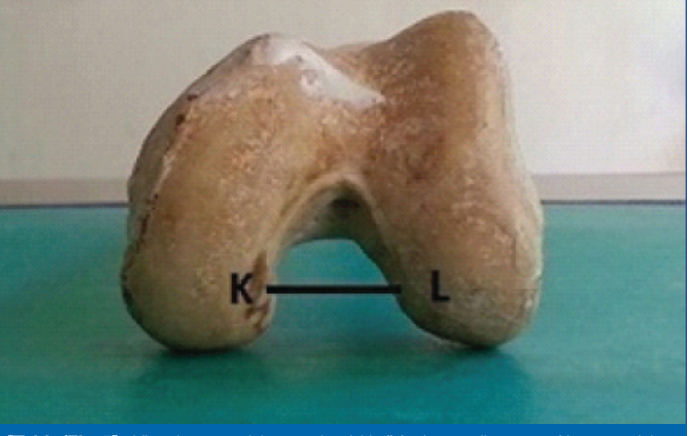
[Table/Fig-5]: KL = Intercondylar notch width (Maximum distance of intercondylar notch between two condyles posteriorly).