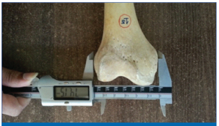
[Table/Fig-1]: AB= Bicondylar width (Maximum distance between both femoral epicondyles).

(6) Intercondylar Notch Width (ICN W)-Maximum distance between medial and lateral surface of intercondylar notch posteriorly [Table/Fig-5].